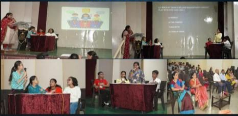
DAY 1- QUIZ ON THE BARD