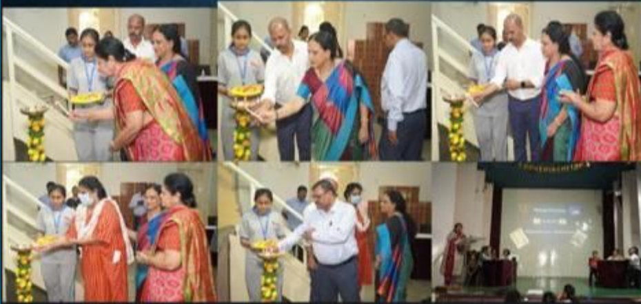
DAY 1- QUIZ ON THE BARD